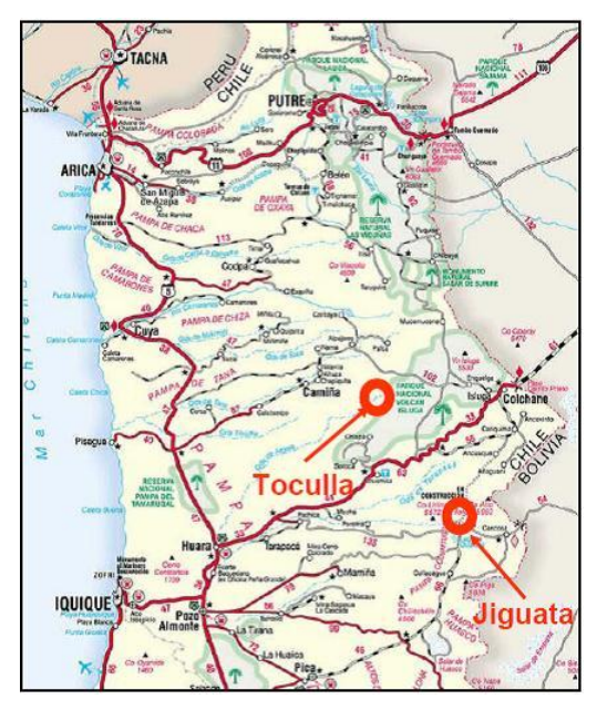
Figure 1: Location of the Jiguata and Toculla Projects

Due to severe financial constraints throughout the year no field work was undertaken at either Jiguata or Toculla. However, all land taxes and other necessary steps to ensure ownership have been paid up to date and the concession titles remain in good standing at both areas.