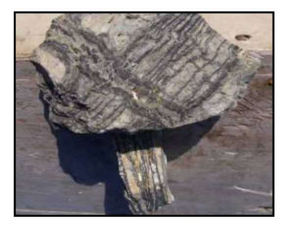
Figure 2a: Banded quartz veinlets from Andina Minerals' Volcan Project.

In the Maricunga mine, gold mineralisation is found both in porphyry-hosted stockworks and in subvertical sheeted veins systems with a strong structural control. This structural control is seen at outcrop scale but it is also reflected in the northwest alignment of intrusives and the three centres of mineralisation in the district, Verde, Pancho and Guanaco.