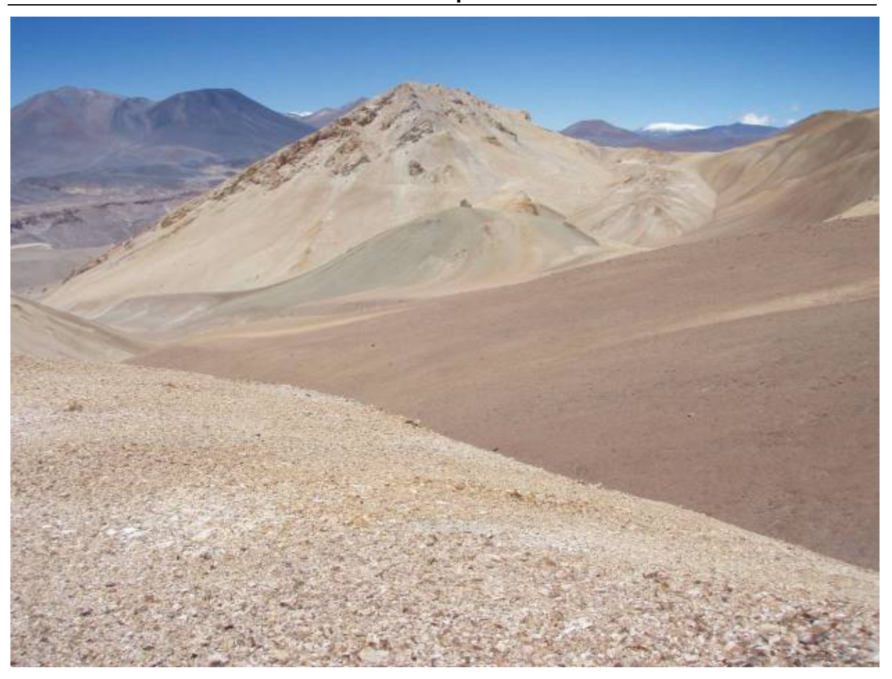
Figure 4: View southwest of the Falda Norte lithocap on the left on-lapping Central Porphyry on the right. Porphyry Norte is the greenish coloured hill in the middle distance.

La Falda lies at an altitude between 4,200 and 4,700 metres in Chile's Andean Cordillera. While mines at this altitude in Chile can continue operations year-round, exploration activities are severely curtailed between the months of April and November. Consequently, fieldwork under the Joint Venture is not expected to start in earnest until December 2008 although every effort will be made to start earlier, if possible. Dependent on the weather, fieldwork will start to be scaled back again with the onset of the Chilean winter in March 2009.