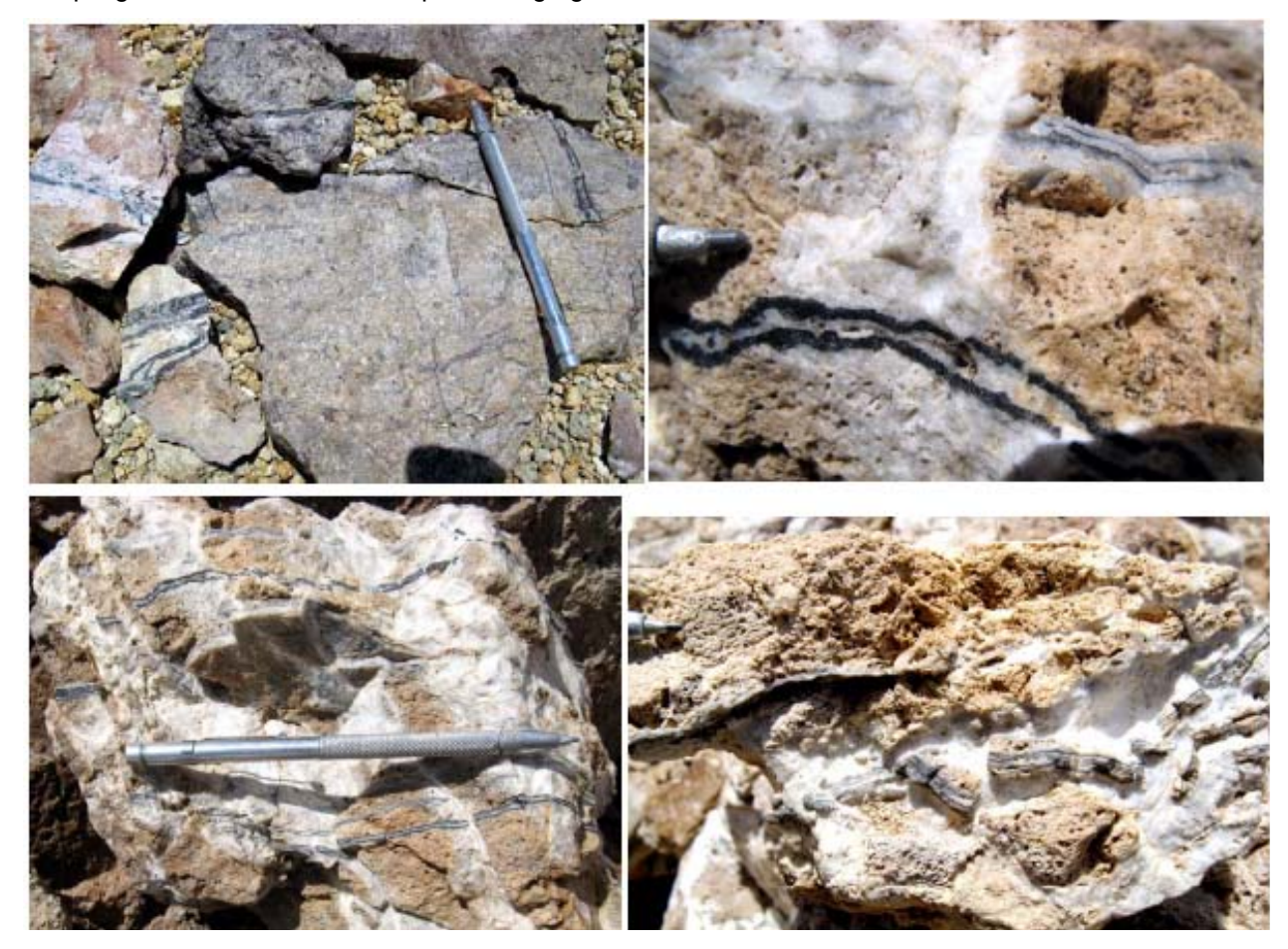
Figure 3: Banded quartz veins at La Falda. Compare the similarity in appearance and occurrence to those shown in Figure 2.

The gold porphyry mineralisation discovered to date at La Falda is centred on two out of three known porphyry intrusions, distributed over 3 km in a north-south direction. Banded quartz veins very similar to those found in the gold porphyry deposits in the Maricunga Belt have been found at surface in two of these intrusions. Recent mapping by Catalina has located two discrete areas of such veining and sampling has returned values of up to 1.26 g/t gold.