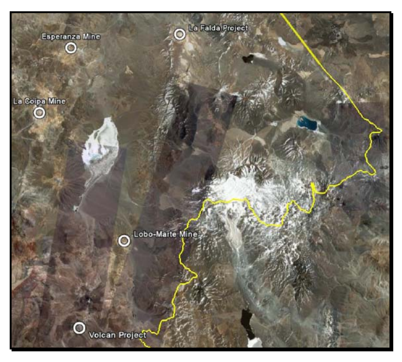
Figure 1: Map showing the location of principal epithermal, gold-porphyry and porphyry coppergold deposits in the northern part of the Maricunga Belt.

Gold in the Maricunga district of Chile is produced from a variety of epithermal, porphyry and gold-porphyry deposits. The La Falda Project is in the northern part of the district, to the north of the Maricunga (formerly Refugio), Volcan, Lobo-Marte and La Pepa porphyry gold deposits. The locations of some of these deposits are shown in Figure 1.