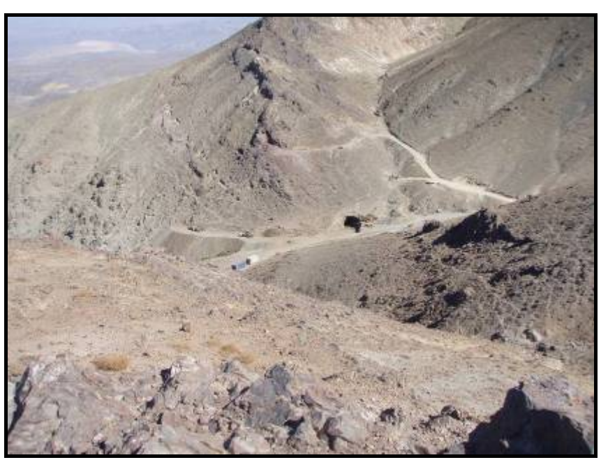
Figure 5: Recent mine workings on the Perla shear zone. The photograph has been taken looking north from Catalina ground.

A local mining company has recently opened an adit into the Perla shear zone where it crosses over into an adjacent concession. The adit was driven 200 m north along the zone until it intersected a skarn deposit developed where the shear zone has intersected a carbonate horizon. Analytical data on the mineralisation are not available.